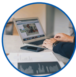
Social Media Advertising Campaigns