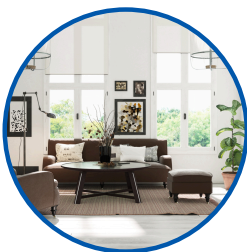
360° Virtual Tours